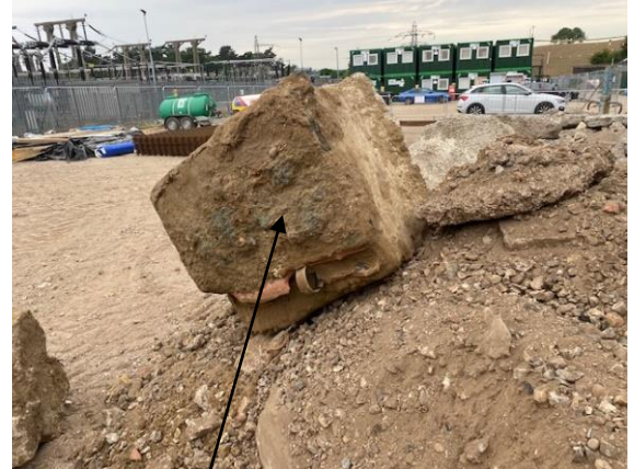
Concrete block (after removal) Approx position prior to removal

The approximate position of the concrete block is shown by the red outline on the picture to the right.